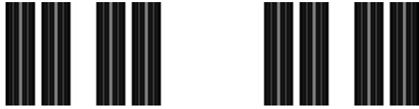
Fig. 3 The set K . After white intervals have been removed, the black points which remain make up K

Proof Let O be open and x \in K \cap O . Then, since x \in K , x is in a remaining interval at each stage of construction of K . Let R_{n,x} denote the remaining interval containing x at stage n of construction. The length of remaining intervals tends to zero, so for N large enough, R_{N,x} \subseteq O . But, by symmetry, m(K \cap R_{N,x}) = (\frac{1}{2})^{N+2} > 0 . (At stage N of construction, there are 2^{N+1} remaining intervals and they split the measure of K equally). Thus